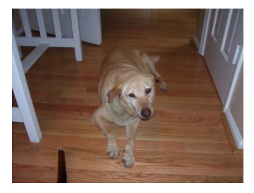
Amber 6 year old